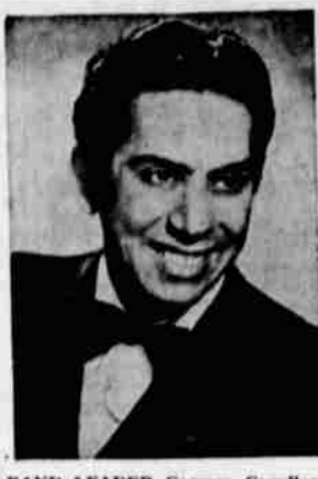
BAND LEADER Carmen Cavallaro will play here December 15.

Anti-labor Parties The anti-labor opposition in Australia comes from two parties, the liberal party and the country party, which promise to work in unison should labor be defeated.