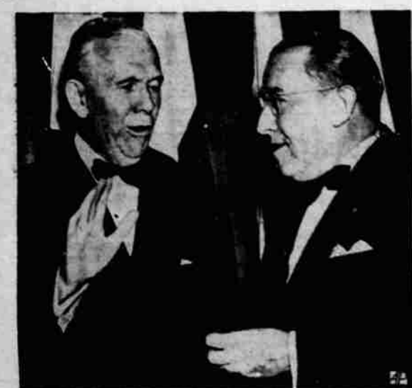
RED CROSS HEADS—Gen. George Marshall (left), new president of American Red Cross, chats with Basil O'Connor, former president, at a Washington dinner in O'Connor's honor.