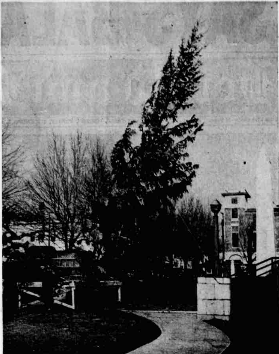
THROUGHOUT THE MONTH OF DECEMBER, this 40-foot fir will stand in front of the Klamath county courthouse, typical of the Christmas spirit of the town. This picture shows the fir hoisted to its platform by a Copco crew. The tree, brought from the woods by Weyerhaeuser Timber company, was being decorated today by the 20-30 club in preparation for tonight's big Christmas opening.

The next meeting is planned for January 6 at the school house.