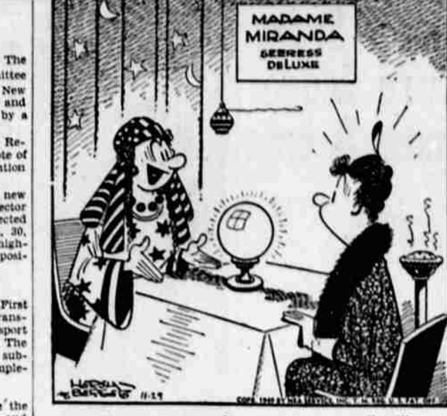
"I have a message for you that comes collect!"

Austria's principal rivers are the Danube, Inn, Enns, Drau, Ill and the Mur.