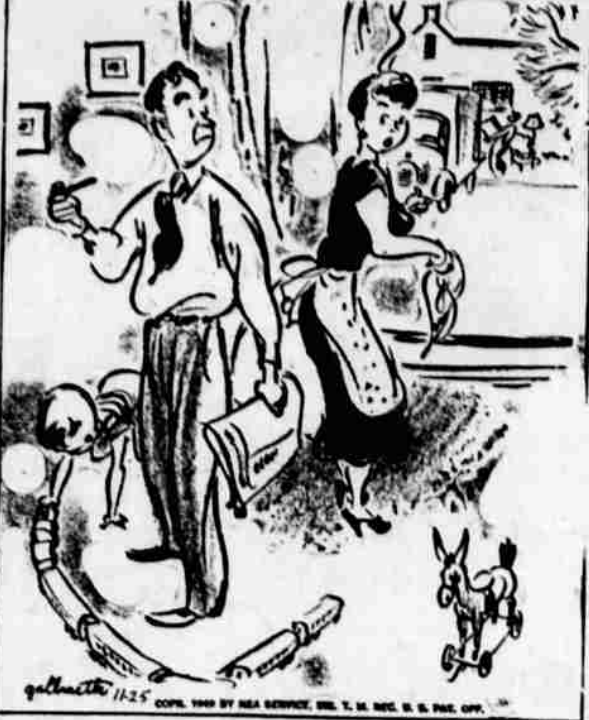
"It would be nice and neighborly, Bill—just ask him if you can help him with the moving, and see if you can spot those books they borrowed!"