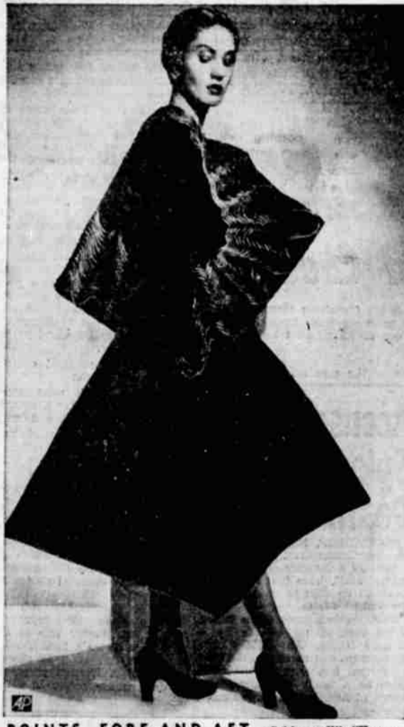
POINTS FORE AND AFT—Schiaparelli's "House of Cards" silhouette is of red velvet embroidered in rows of colored sequins with jacket and skirt cut and wired into points.