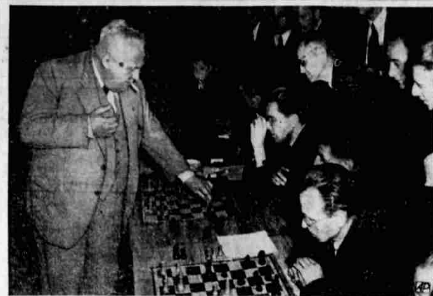
PLAYING ALL COMERS—E. D. Bogoljubow (left), 1949 German chess champion, plays 40 opponents simultaneously during finals of the German chess clubs championships at Darmstadt.