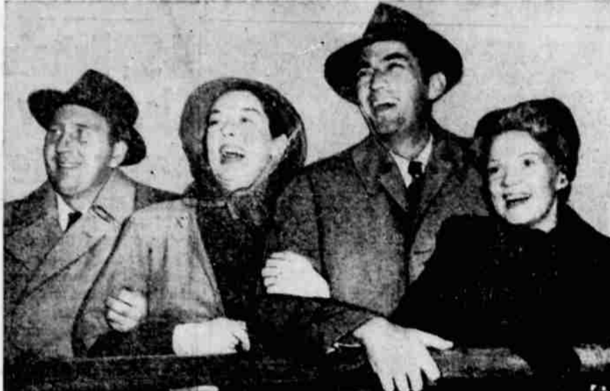
ENTER, LAUGHING—Frederick Brisson and his wife, Rosalind Russell, and Gregory Peck and Mrs. Peck (l. to r.) arrive in England aboard Queen Elizabeth for a royal command performance.