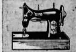
PORTABLE COMPLETE WITH CASE