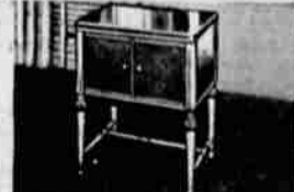
END TABLE MODEL