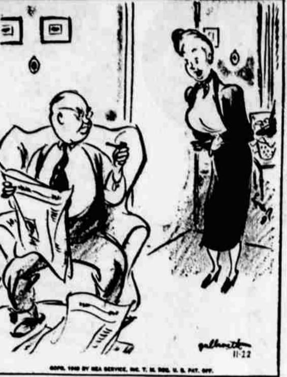
"Just look how much I've lost on that diet—now I'll have to buy a new suit!"