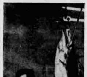
Joe Cheshul, a younger and faster fighter, met tonight in a Newark armory.