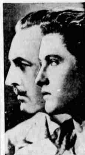
GREAT PROFILES —Heir to one of the great names, and profiles, in American theatrical history is John Barrymore Jr., right. Young John makes his screen debut in a film soon to be released. At left is the world-famed profile of his father, the late John Barrymore.