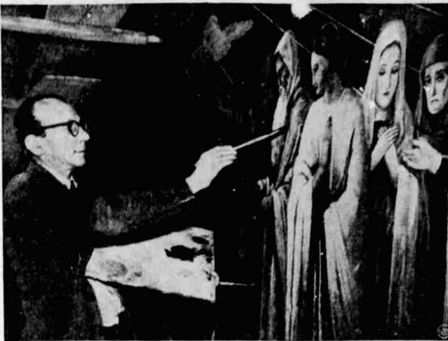
FAMED ARTIST DP FOUND HOSTESS STREETS —Ukrainian artist Edward Kozak, one of Europe's greatest muralists and caricaturists, was found toiling as a street cleaner in Hamtramck, a Detroit suburb. Before the war, Kozak won many honors for his murals, but he was better known for his caricatures and political cartoons. A widely-reproduced caricature of Stalin brought the wrath of Soviet agents, and Kozak became a hunted man. Located by a Detroit architect decorator, Kozak was given a job painting murals and now his work is winning acclaim in Detroit. But, says Kozak: "Even if I have to sweep streets, I would be happy if I can remain in the United States."