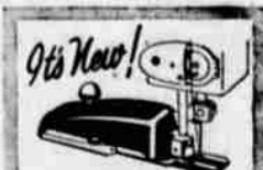
BUTTONHOLE WORKER With the magic key. Makes buttonholes, too . . .

HEADQUARTERS FOR ALL SEWING MACHINE SUPPLIES OIL . . . BELTS . . . NEEDLES . . . PARTS