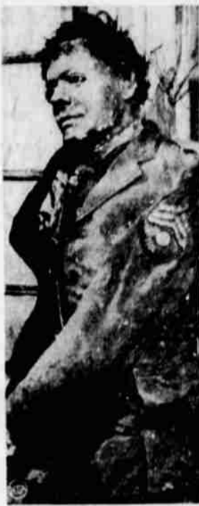
ALEXANDRIA'S dummy: He always comes back to his hook.