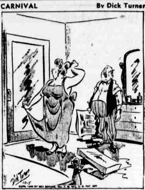
"Well, for a wife whose husband never takes her anywhere, you certainly have to have a lot of new clothes. It seems to me!"

No one can foresee, of course, whether the president would win if he ran again. It would depend on the popularity of his Republican opponent and on the course of events leading up to 1952. But at this moment the voters who think he will run are pretty sure that he will win—quite a different attitude from that found in advance of the 1948 election, when the majority of voters thought Mr. Truman would lose. Here is how those who think he will run answered the question,