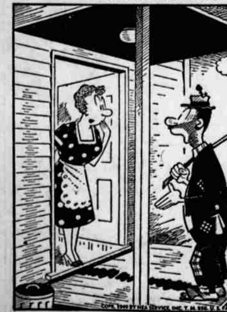
"Lady, I've been on a fifteen-day diet and this is my sixteenth day!"