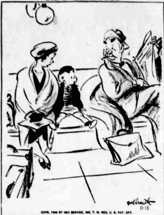
"If you don't behave and stop squirming, that bad man sitting next to you is going to spank you!"