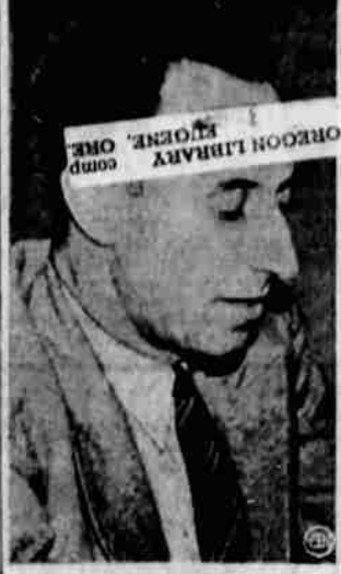
HARRY BRIDGES Under fire again

TROOPS RETURN TACOMA, Nov. 14 (AP)—First of more than 15,000 men to return from autumn war maneuvers in the Hawaiian Islands, 110 men of the Second Division docked here today.