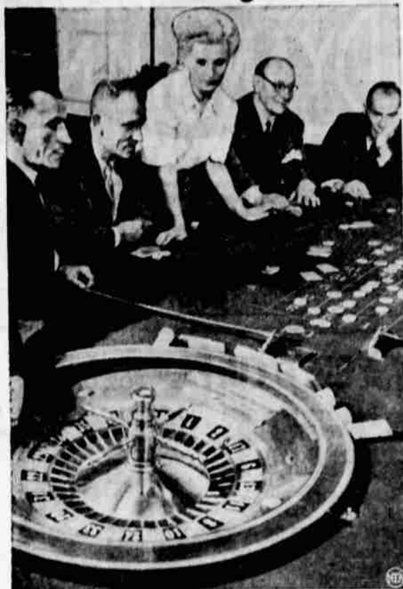
WHEEL'S SPIN at San Marino casino produces mingled expressions on customers from over the Italian border.

SAN MARINO (NEA) — The world's oldest and tiniest republic is gambling on its future by taking its problems of dwindling revenues and rising costs to the gaming table.