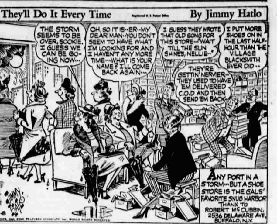
They'll Do It Every Time By Jimmy Hatlo

CHICAGO, Nov. 8 (AP-USDA) Potatoes: arrivals 95, on track 365; total U. S. shipments 612; supplies Flowers: salable none.