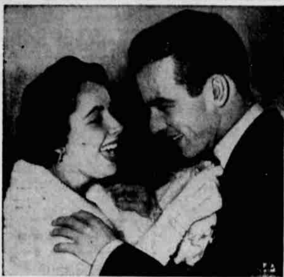
BOWING IN—Elizabeth Taylor, 17-year-old film actress, smilingly adjusts the bow tie of her escort, Actor Montgomery Clift as they arrive for a Hollywood premiere.

CHICAGO, Nov. 8 (AP-USDA) Potatoes: arrivals 95, on track 365; total U. S. shipments 612; supplies Flowers: salable none.