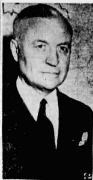
VICE ADMIRAL SHERMAN . . . On big spot

Vaulting Now Sherman is vaulting over the heads of all of them, and over some vice admirals with longer service. Sherman told a news conference yesterday he was making the jump under orders. To do so,