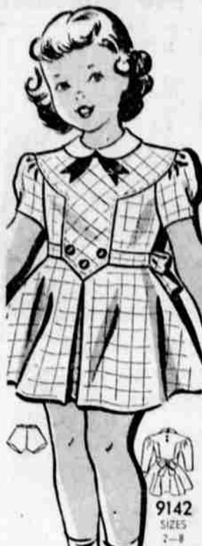
9142 SIZES 2-8 Marian Martin

Make your darling happy by making this brand new princess-yoke