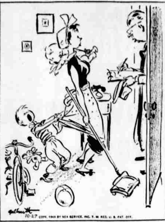
"We're making a survey, madam—how much of your leisure time do you spend in the public library?"