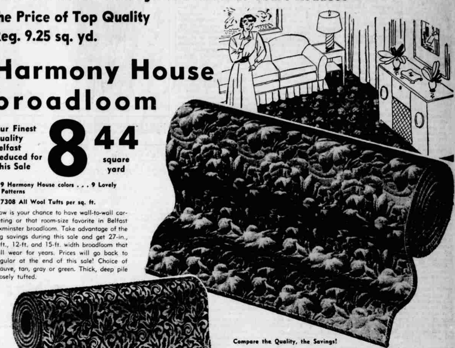
Compare the Quality, the Savings!

Now is your chance to have wall-to-wall carpeting or that room-size favorite in Belfast Axminster broadloom. Take advantage of the big savings during this sale and get 27-in., 9-ft., 12-ft. and 15-ft. width broadloom that will wear for years. Prices will go back to regular at the end of this sale! Choice of mauve, tan, gray or green. Thick, deep pile closely tufted.