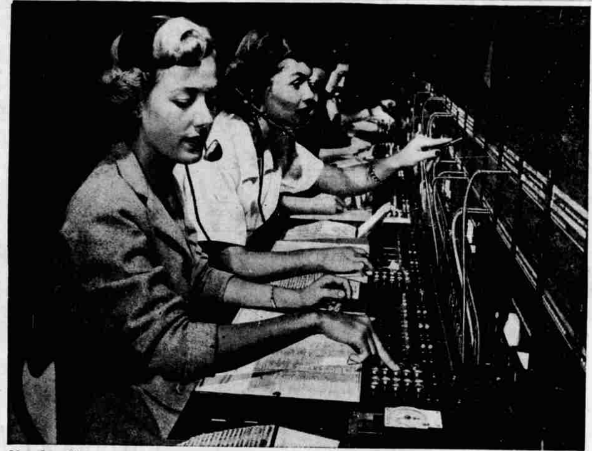
Many Long Distance operators now ring telephones in a number of cities across the country...much as you dial a call.