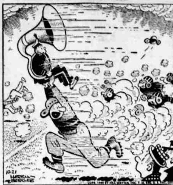
"The pass popped into his tuba!"