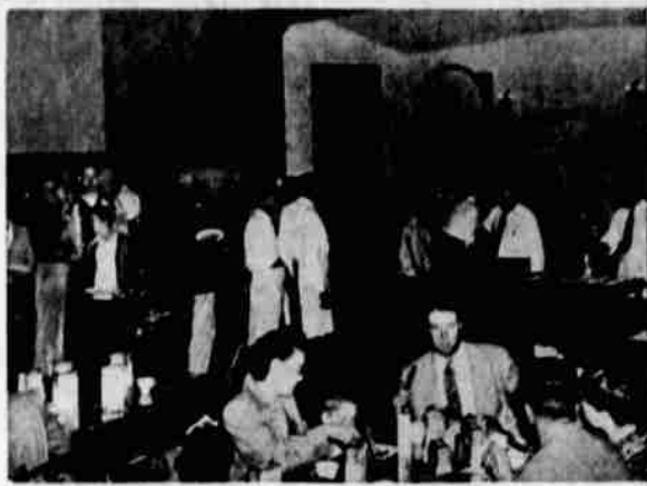
ALTURAS FOLKS turned out for the Alturas Lions club pancake feed held at Memorial hall there last Saturday night. The Lions club sponsored the supper for their project to purchase lights for the new tennis court and skating rink at the park. Firms contributed to the success of the pancake supper which drew a large crowd.

This means that veterans who might not otherwise qualify for life insurance for health reasons may maintain lapsed NSLI or buy new or additional insurance up to the