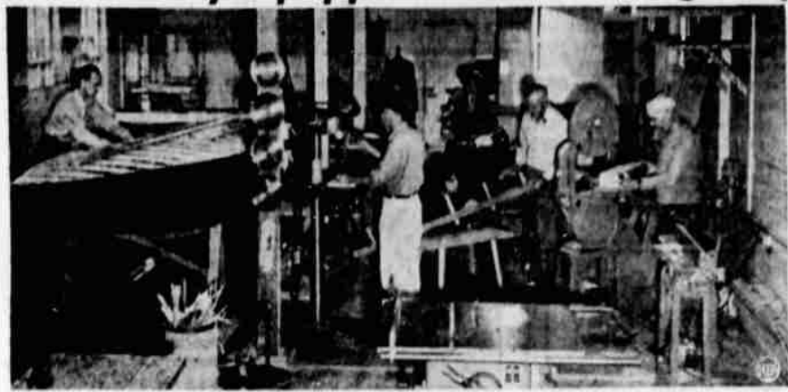
YOUR WORKSHOP is open for business, with an engineer working on a sailboat, a salesman at the drill press, a housewife building a coffee table, and other amateur cabinet-making projects going on. Space is available at 25 cents an hour.