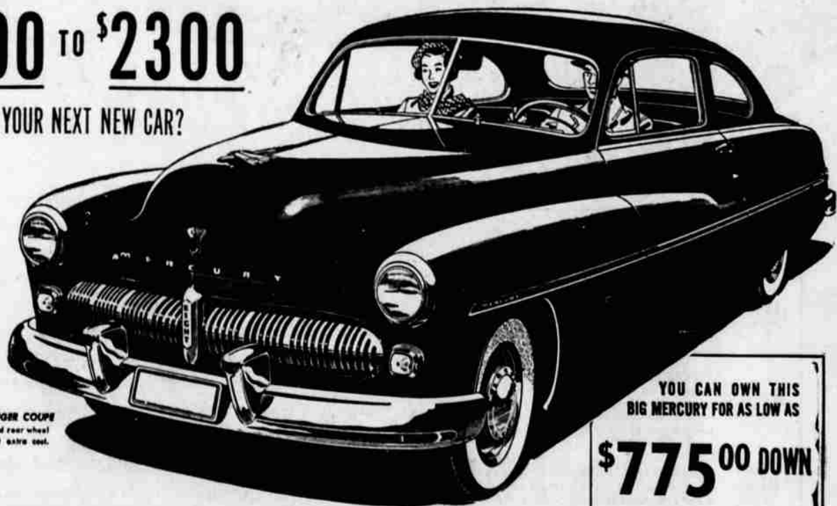
MERCURY SIX-PASSENGER COUPE White side-wall tires and rear wheel shades are optional at extra cost.

ARE YOU FIGURING ON $1800 TO $2300 FOR YOUR NEXT NEW CAR?