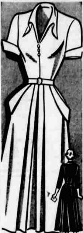
PATTERN-9215 12-20, 35-42

MARIAN MARTIN Your pride in your pockets and in that deep neckline, wing collar and cuffs! You'll be proud, too, of that chic new skirt with cluster pleats to control fullness! Pattern 9215 comes in sizes 12, 14, 16, 18, 20, 22, 24, 26, 28, 30, 32, 34, 36, 38, 40 and 42. Size 16 takes 4 1/2 yards of 39-inch fabric. This easy-to-use pattern gives perfect fit. Complete, illustrated Sew Chart shows you every step. Send TWENTY-FIVE cents in coins for this pattern to Klamath Falls Herald and News Pattern Department, P. O. Box 6740, Chicago 80, Ill. Print plainly YOUR NAME, ADDRESS, ZONE, SIZE, STYLE NUMBER. Don't miss our Marian Martin Fall and Winter Pattern Book! Smart, new clothes to sew at home. Gift ideas by the score. Send fifteen cents for this book—a Free Pattern is printed in the book—a new waist to wear with your skirts and dresses.