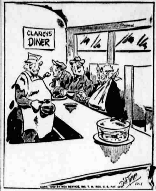
"I'd been taking this correspondence course in developing a dominant personality—but it develops my wife's been opening my mail and getting all the dope first!"