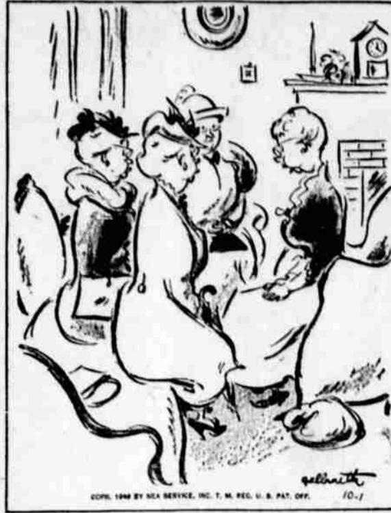
"I told all the relatives I visited last summer I loved them but would be happier at home—and they agreed with me!"