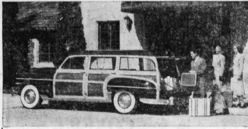
Chrysler's first post-war station wagon, a 9-passenger Royal model, combines beauty with utility. The white ash trim provides a pleasing effect in contrast with the mahogany paneling, which really is metal that has been processed to resemble the grained wood. The spare tire is easily accessible in a special compartment

Mr. and Mrs. Pete Fisher have returned home after an extensive trip through Eastern states and Canada where they visited friends and relatives for some time past.