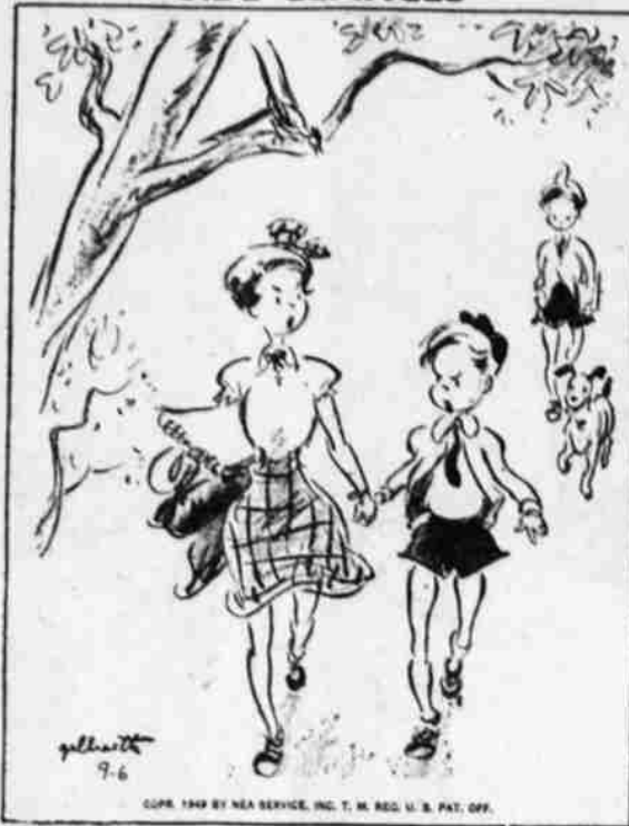
I don't know whether I'm going to like school or not—do they have any courses for mounted policemen?*