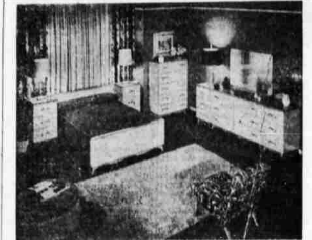
VERY NEW AND SMART is the combination of light and dark woods used for this attractive modern bedroom furniture. The light colored wood is the new African korina, which closely resembles mahogany, while the darker trim is mist gray walnut. Graceful, silver drawer pulls and curved bases add distinction to this flexible, modestly priced group.

Lettuce is plentiful and nutritious—so serve it often right now. Use it in salads and sandwiches. As soon as it comes from the market tear off any withered leaves on the outside of the head. Rinse the head off under cold running water before storing it in a covered container in the refrigerator. Never soak lettuce in water before slicing. Instead of using a covered container for the lettuce you may wrap it in a damp cloth if you like.