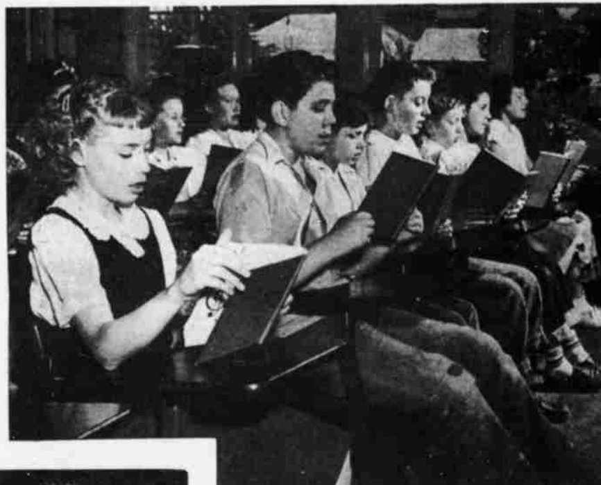
MUSIC HAS A BIG ROLE —Starting early in school, music plays an important part all through the school years. Choral work, illustrated above, is always a favorite.