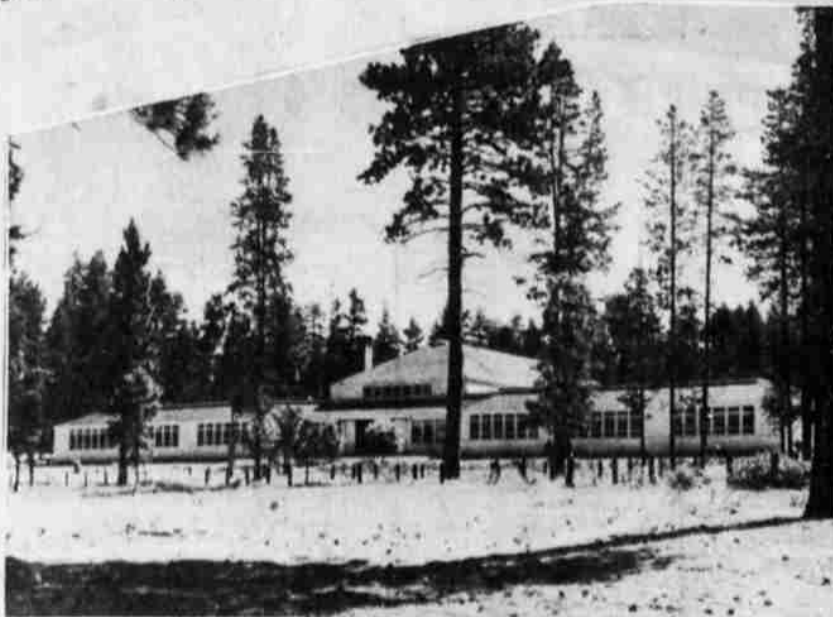
Gilchrist school has made walking easier and more delightful with new floor covering from Calhoun's.