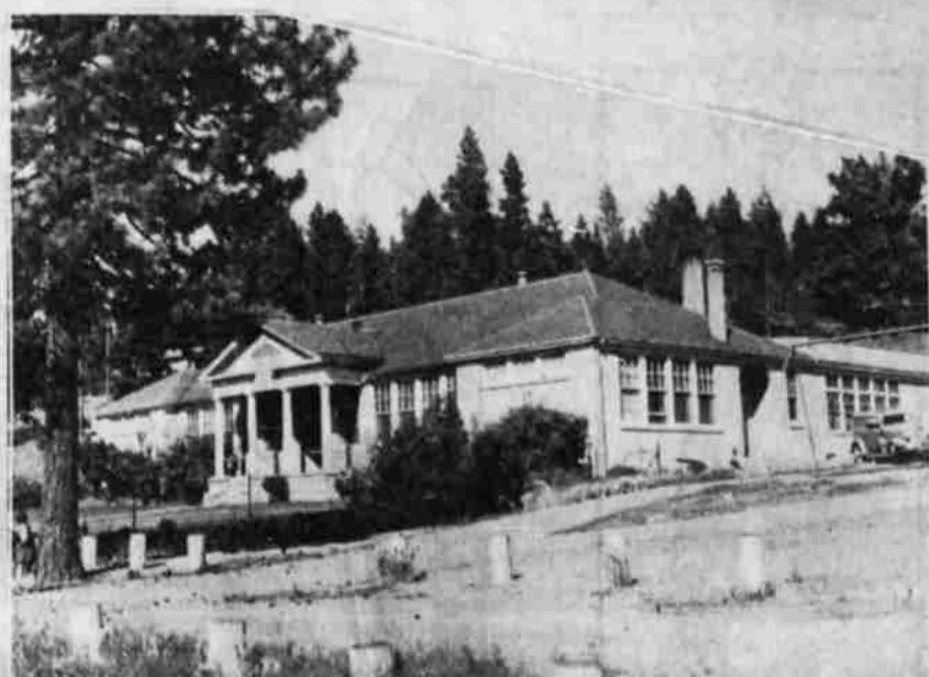
Chilquin high made use of new floor coverings to make "back to school" even more interesting to the students. Floors by Calhoun's.