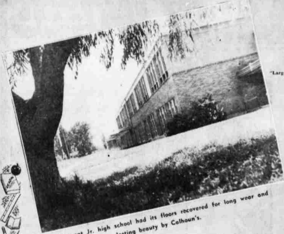
Altamont Jr. high school had its floors recovered for long wear and lasting beauty by Calhoun's.

WE specialize in Floor Coverings on any and all kinds of floors.