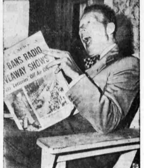
RIGHT UP ALLEN'S ALLEY—Fred Allen, radio comedian, vacationing at Sea Girt, N. J., picked up a newspaper and laughed and laughed. One of Allen's pet hates, radio giveaway programs, had just been banned by the federal communications commission. Said Allen to newsmen, "They have taken radio away from the scavengers and given it back to the entertainers."