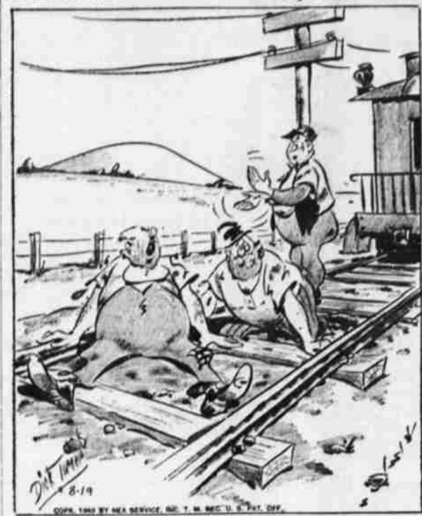
"V'know, it's these pesky stopovers that play hob with a fellow's schedule!"