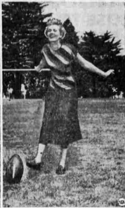
Permanent pleats will spread their charm over the campus. Plaid wool skirt takes boxed pleats and a jaunty reefer of solid color wool fleece (left). Solid colored jersey skirt unfurls knife pleat beneath long-torso blouse of multi-color wool jersey (right).

By EFNIE KINARD NEA Fashion Editor NEW YORK, (NEA)—Permanent pleats are science's gift this fall to the school girl.