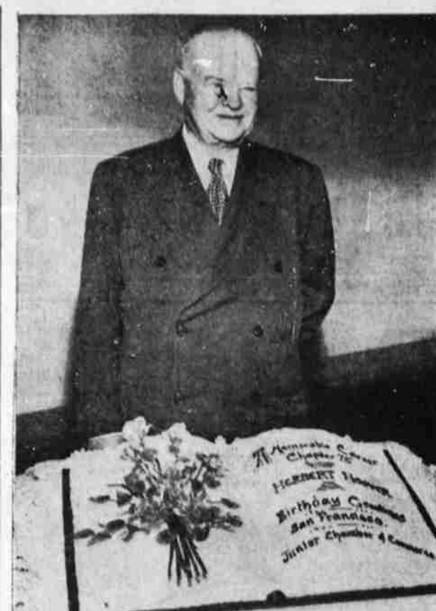
CELEBRATES 75TH BIRTHDAY —Herbert Hoover, the only living ex-president of the United States, accepts the elaborate cake presented to him by the San Francisco Junior chamber of commerce on the occasion of his 75th birthday. The cake, shaped like a large book, was presented in the main hall of the Hoover institute and library at Stanford university, Calif.