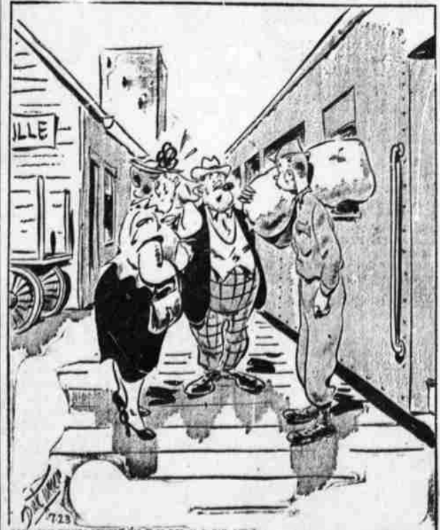
"Be careful, Junior, and don't you go getting mixed up in any of those army-navy fights for appropriations!"