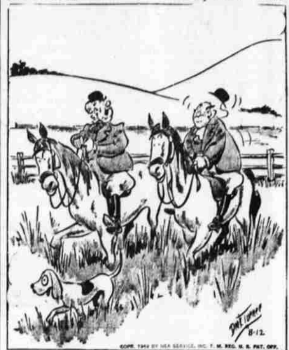
"Wimot, please! The expression is 'riding to hounds,' not 'going to the dogs!'"