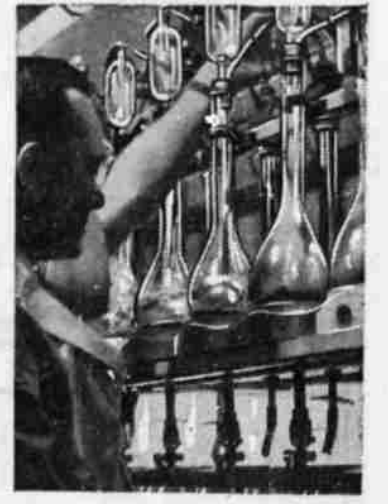
Testing tobacco. Samples from every tobacco-growing area are analyzed before and after purchase. These extensive scientific analyses, along with the expert judgment of Lucky Strike buyers, assure you that the tobacco in Luckies is fine.

Everything's under control! Lucky Strike scientists supervise intricate tests daily to guarantee that the weight, size, density and firmness of your Lucky Strike are always right. Such details are rigidly controlled to guarantee you a truly finer cigarette.