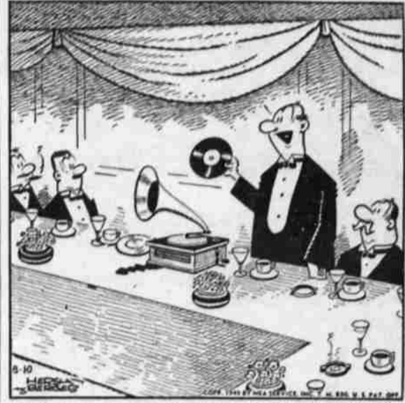
"Gentlemen, our speaker has dyspepsia so he sent his speech on a platter!"

The American automobile industry produced 4,797,650 passenger cars and trucks in 1947.