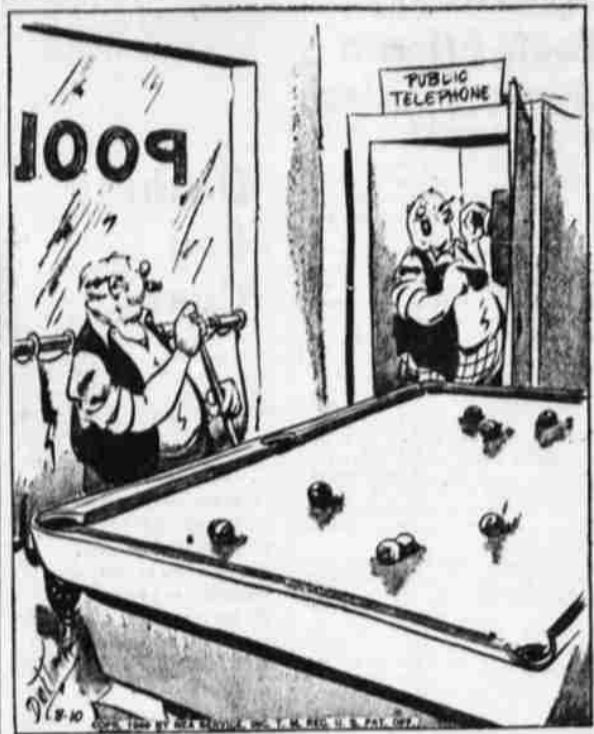
"It's your wife calling to see if anything's happened to you! She says if nothing has, something will!"