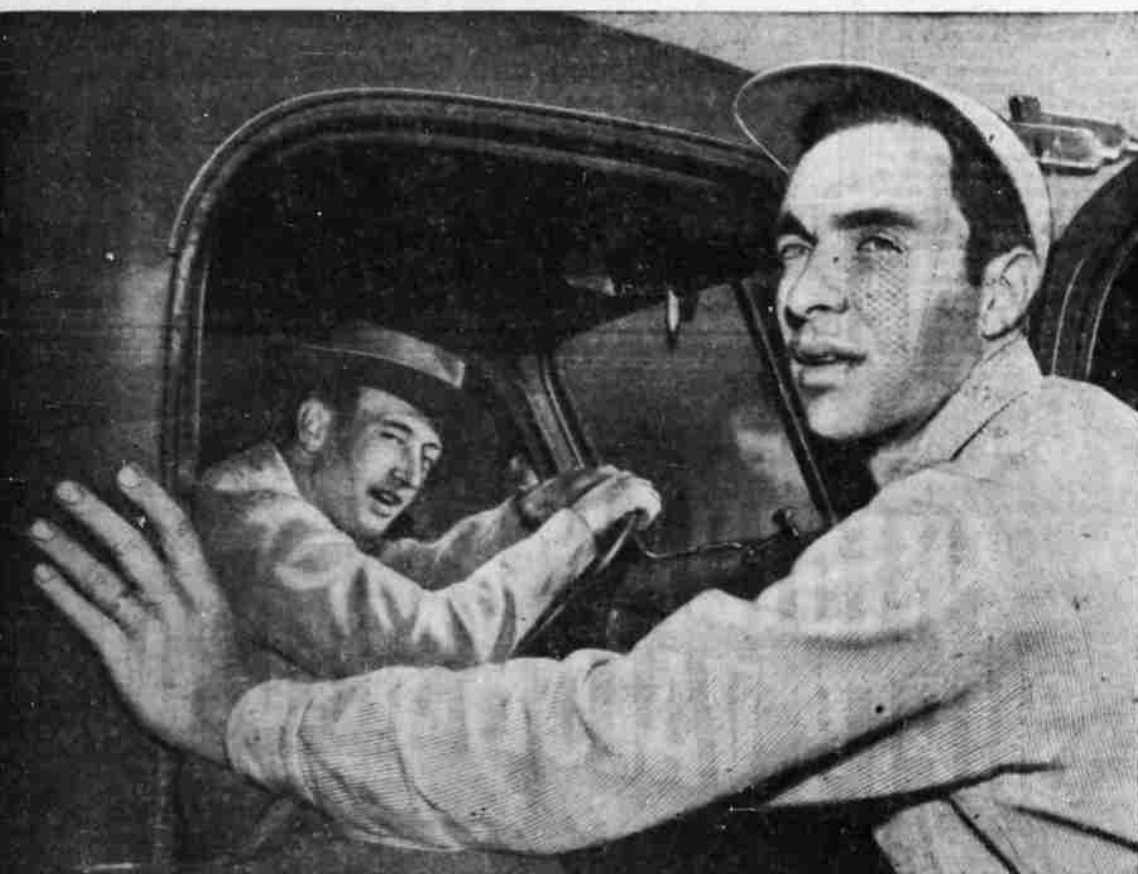
These telephone men will soon make a damaged long distance cable carry calls again. Come along and see how it's done.