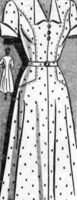
PATTERN-9016 SIZES 34-48