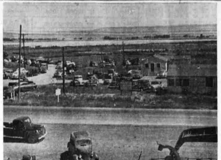
SPECIALISTS VIEW CROPS —Agriculturists of the University of California and 200 Tulelake growers were present for the annual field day Thursday sponsored by the Tulelake experiment station and the Tulelake Growers. The above picture shows a part of the crowd gathered at the station to view crops grown on the 13-acre field at the station before moving to the Growers' transient labor camp at Newell for dinner.