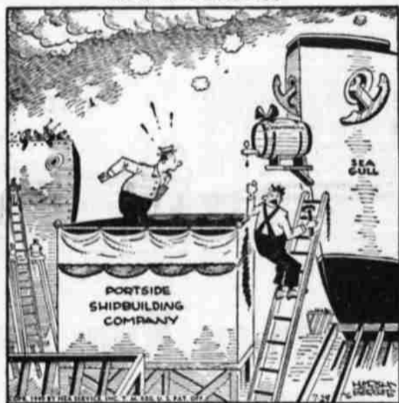
"All set for the christening, boss—I've eliminated the usual difficulty of breaking the bottle!"

Now at last... famous Wieland's LAGER BEER available in Oregon!