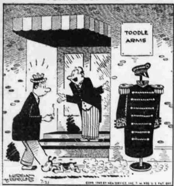
"We couldn't afford to keep the man on!"