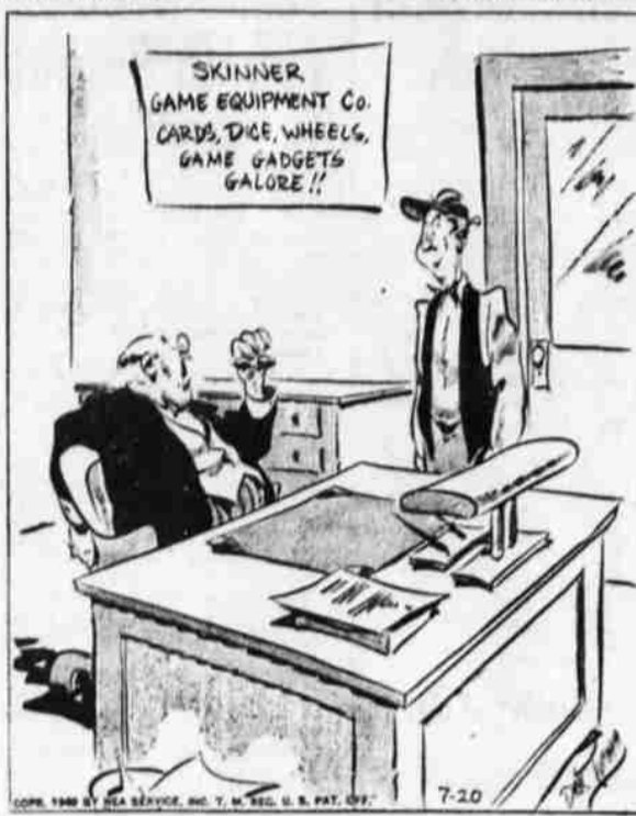
"About that raise you mentioned, Broadstreet—I'll match you double or nothing!"