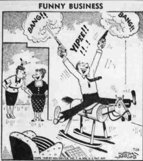
"He's been reading Junior's comic books!"