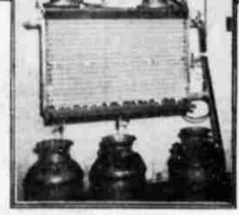
Refrigerated quick-cooling machine preserves the high quality necessary in most rigid Guernsey standards. Entire process takes but a few minutes. Individual animal's record is carefully posted twice daily.