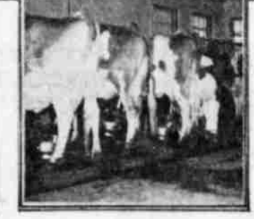
Kitchen-clean, 16-station milking room is filled several times during each milking operation. Production line system moves milk through efficiently, under perfect sanitary conditions.