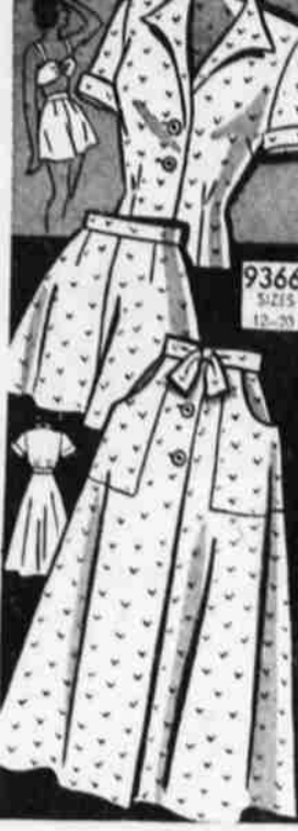
MARIAN MARTIN You MUST have this perfect foursome for vacation! Plunge-neck shirt, big-pocketed skirt is a gas