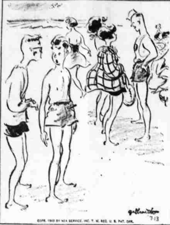
"The girls around here seem to like old men—that guard must be at least 25 years old!"