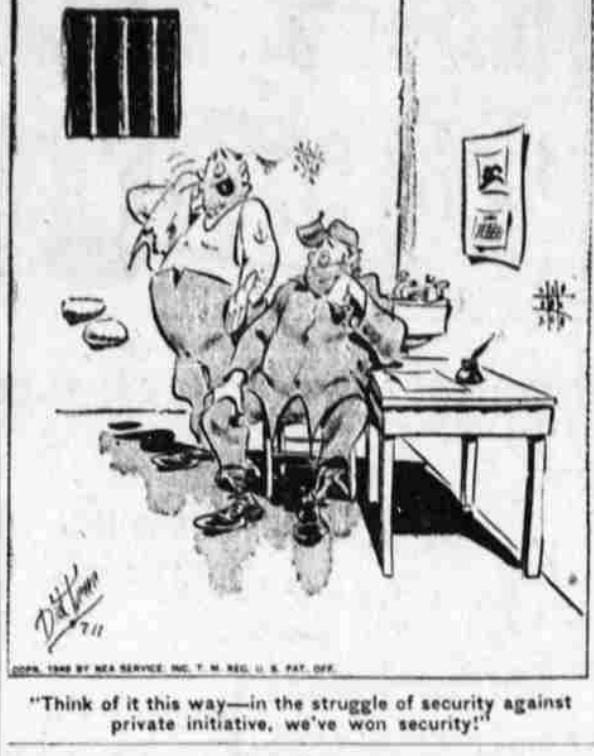
"Think of it this way—in the struggle of security against private initiative, we've won security!"