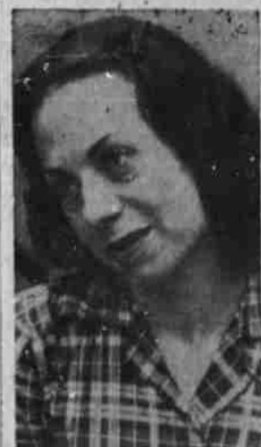
SPY—Judith Coplon was found guilty today on two counts of spying for Russia.

No estimate was made of the total that will be taken by drowning, fireworks accidents, heat exhaustion, food poisoning and other summer holiday hazards.