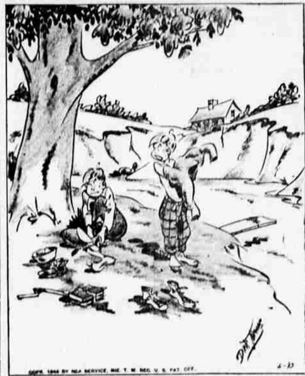
"If my folks want me to grow up to be president, they're certainly giving me good training—jumping down my throat every time I open my mouth!"