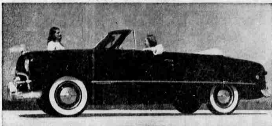
The distinctive styling of the 1949 Ford convertible features smooth, flowing contours, full fender-width body and luxurious interior appointments. Completely new, the convertible chassis is doubly reinforced.