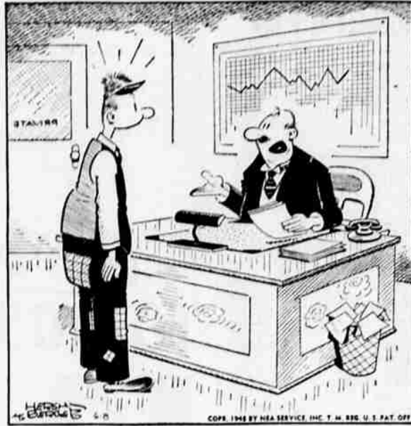
"Sorry I can't give you a raise, but I'll buy you a new pair of pants!"