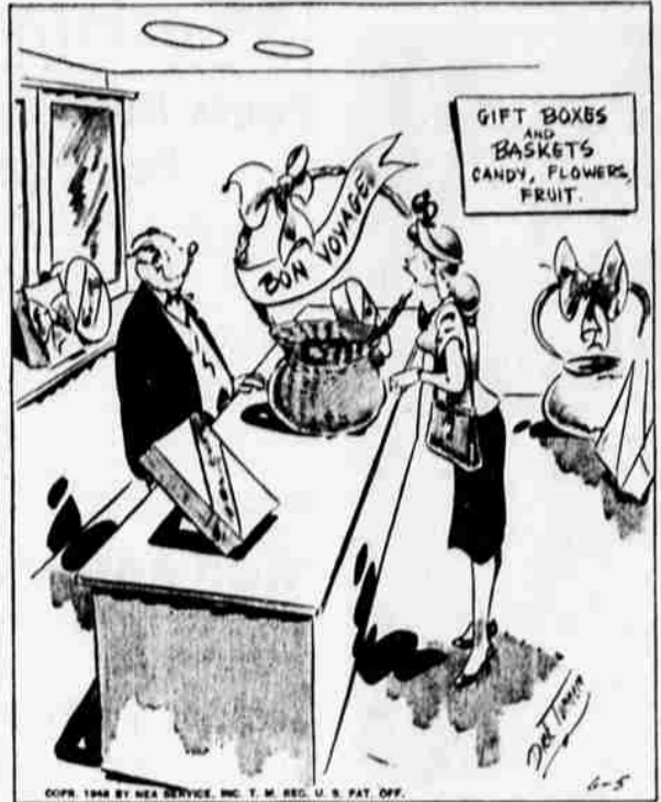
"Fill the basket with seack remedies—it's no use wasting good food!"