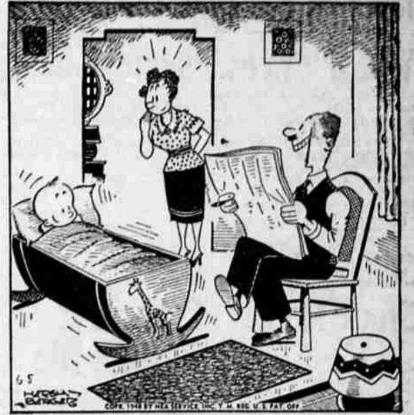
"Notice how he smiles, dear, when I call him Mr. President!"

Serve in the United States navy or be one of Uncle Sam's traveling tourists, and at no expense to you. The navy recruiting station is located in the post office building, room 307.